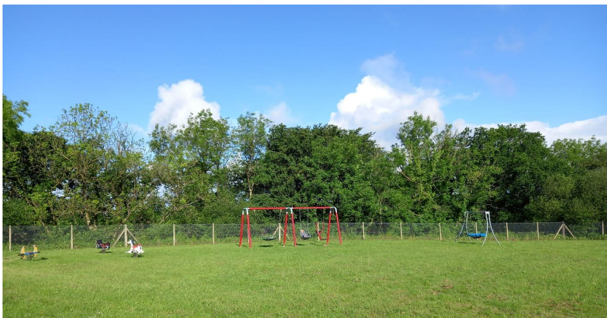
Cae Idole Field